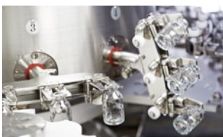
Industrial Automation / Factory Automation