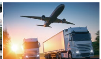
Aerospace / Automotive / Commercial Vehicles