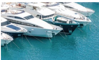
Marine Electronics / Cruise / Shipyards